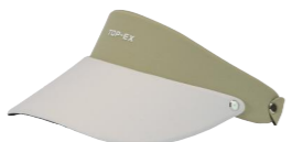
GULL GREY+MINERAL GREY